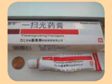
Yisaoguang Yaogua is an ointment from China used to treat skin rash.