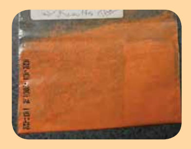
Hondan is a powder often used as an ointment for diaper rash and dry skin.