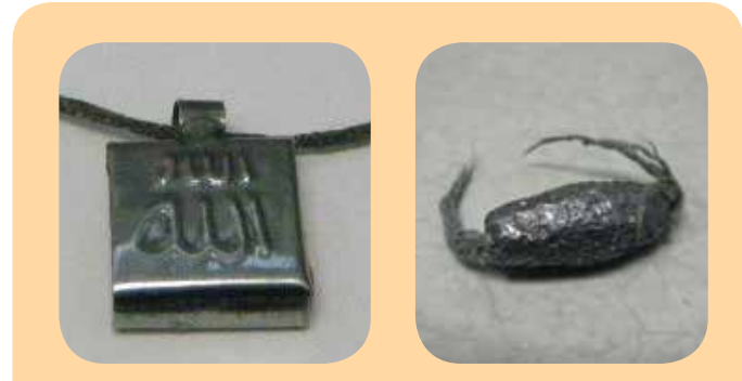
Metal jewelry, including gold or silver plated, can contain lead. Children should never put metal jewelry into their mouths.

Contact your doctor, your local Health Department, or refugee resettlement case manager if: