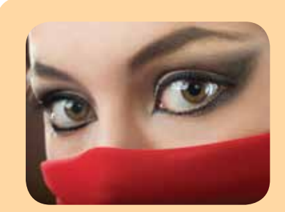
Cosmetics can also contain lead. Kohl (also known as surma or kajal), is one example. It is used to accent the eyes.