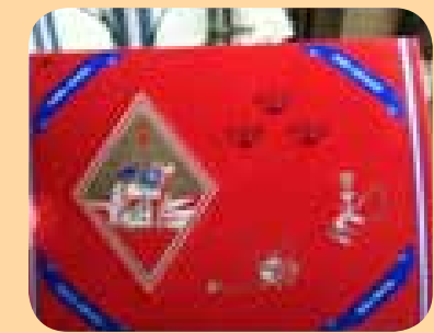
Incense and some candlesticks can contain lead. Lead can be in charcoal, "unsi", and other incense you burn in your house and in some candle wicks.